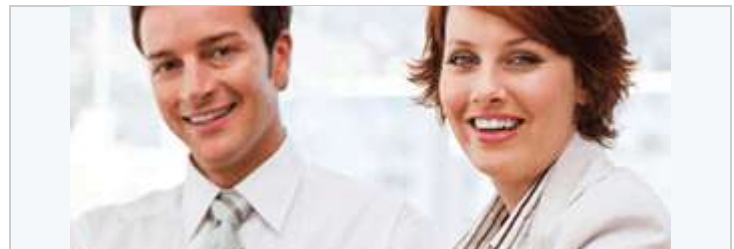
Cerner Ambulatory Practice Management Specialty Practice Management is a complete front- and back-office solution that offers a rapid return on your